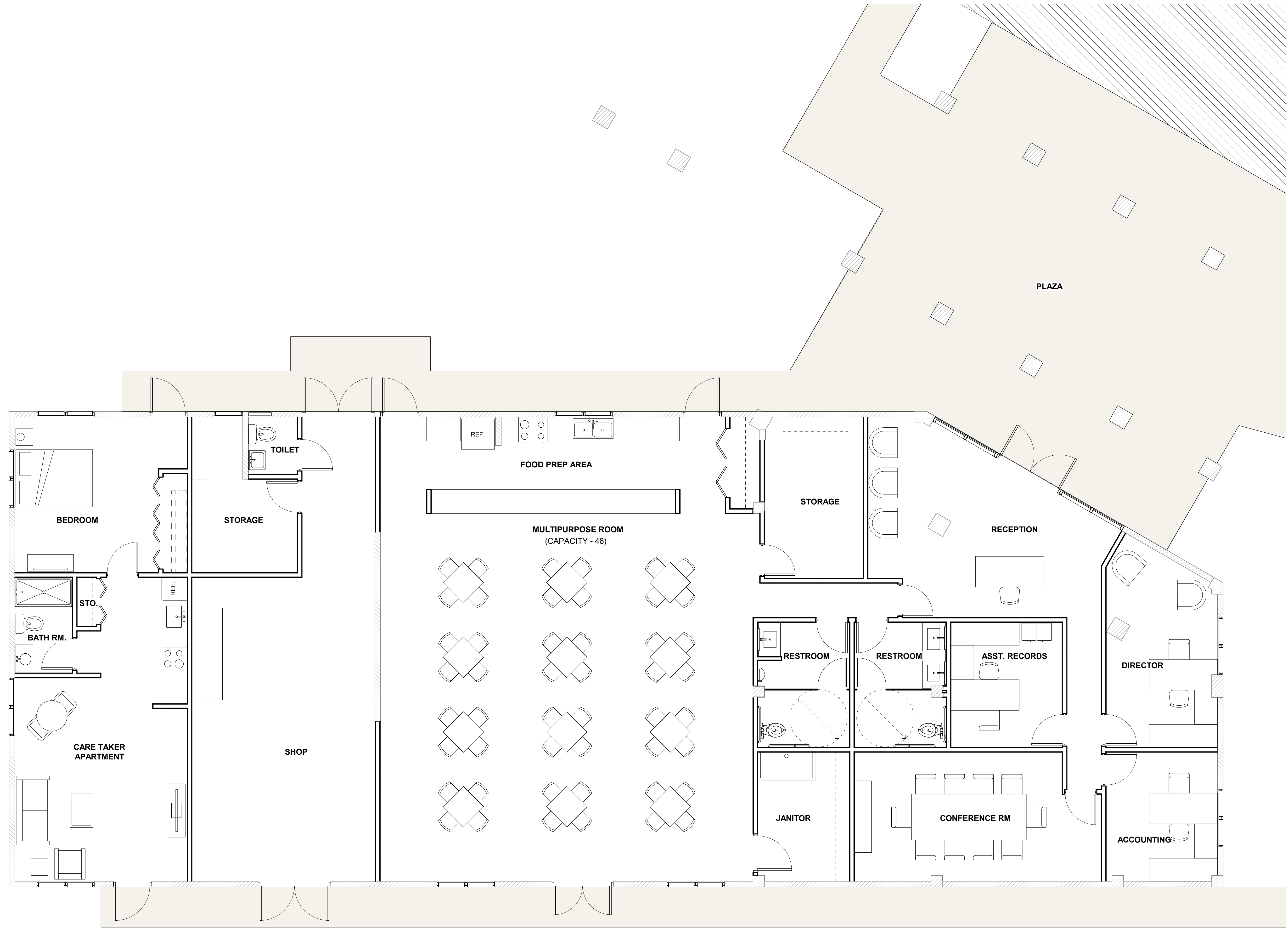
1 MULTIPURPOSE ROOM & ADMINISTRATION 1/4" = 1'-0"